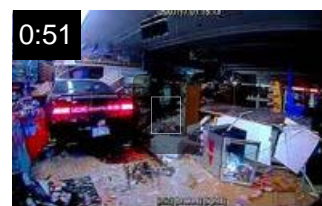
Half-naked man crashes car into store to get beer