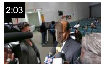
U.S. Attorney holds townhall meeting in Miami to address the opioids crisis